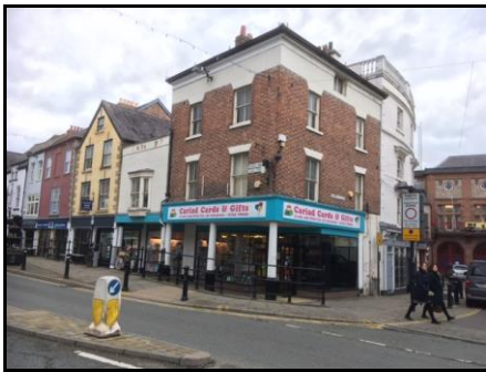
High Street DENBIGH