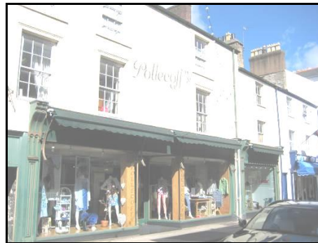
61/65 High Street PWLLHELI