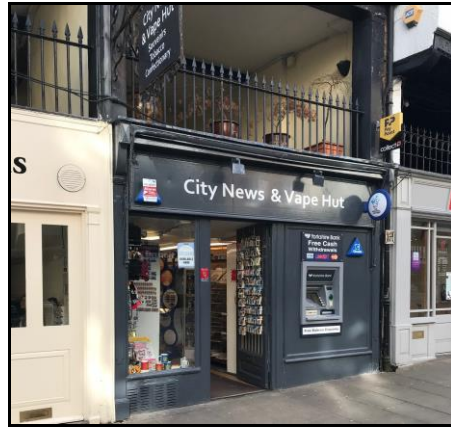
16 Bridge Street CHESTER