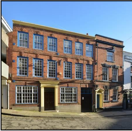
15, 17 & 19 Newgate Street CHESTER