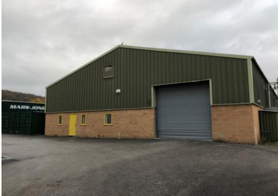
The Top Factory DENBIGH