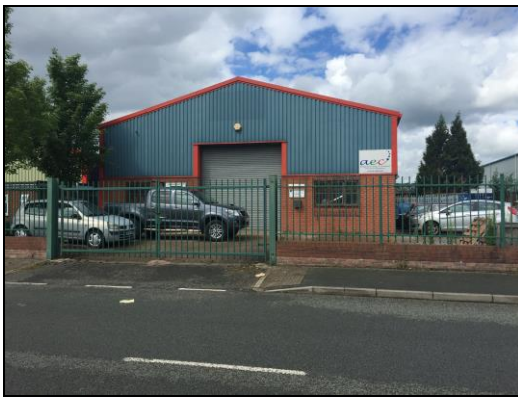
Rhosddu Industrial Estate WREXHAM