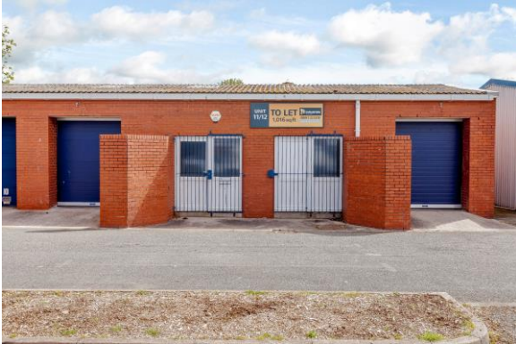
Units 11-12 Tir Llwyd Industrial Est. KINMEL BAY