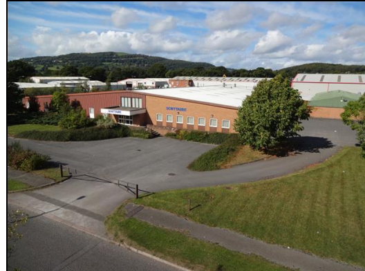
Point 36 Davy Way LLAY