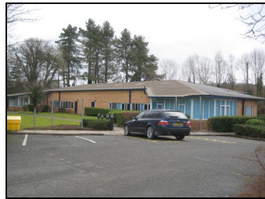
Unit 15 Bala Enterprise Park BALA